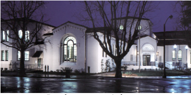
Burlingame Library AIA San Mateo Honor Award