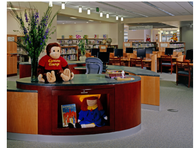
Santa Clara Central Park Library APWA Merit Award ASHRAE First Place Technology Award – Golden Gate Chapter and Region X