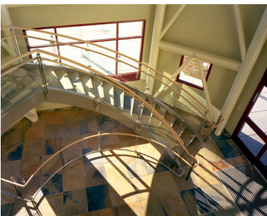
Fairfield Cordelia Library City of Fairfield Design Award