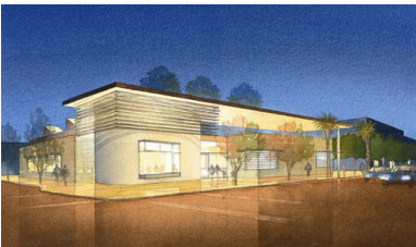
San Francisco Public Library Ingleside Branch