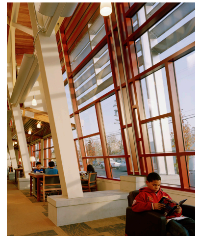
Washington Manor Branch Library San Leandro AIA San Mateo Honor Award