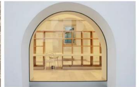
ATHERTON CIVIC CENTER • POLICE AND ADMIN BUILDING - OPTION 1