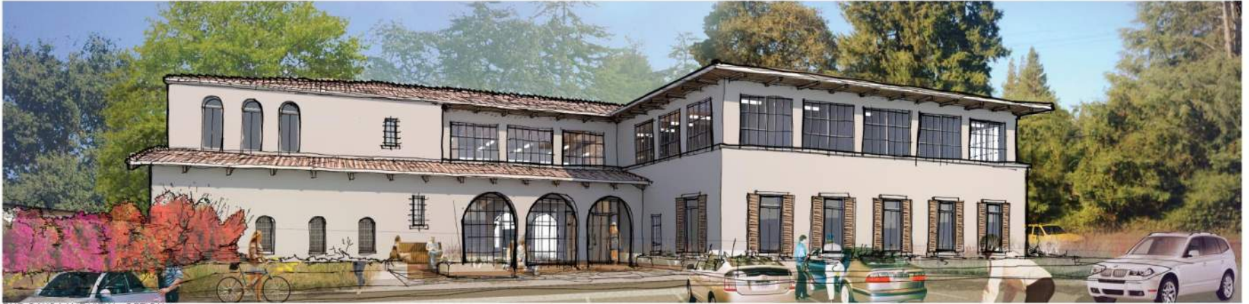
FAIR OAKS LANE VIEW - OPTION 1