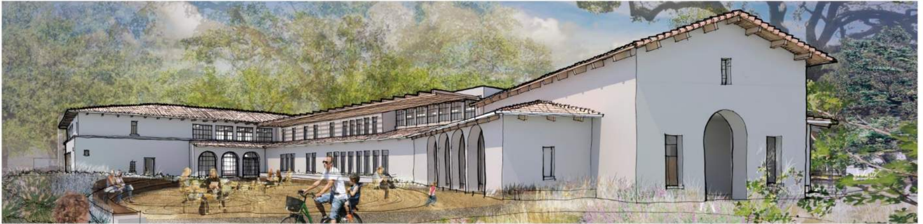
CIVIC COURT VIEW - OPTION 1